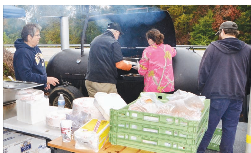
Good food was had by all during the Georgia Sheriffs' Youth Homes Fundraiser at Sundance Grill on Oct. 27.

By Jarrett Whitener Towns County Herald Staff Writer