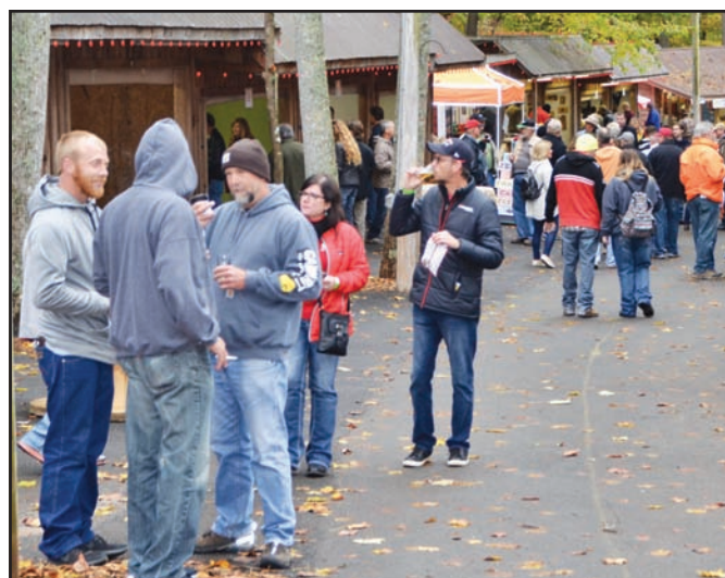
Notice the leaves upon the ground, the jackets and hoodies worn all around - it must be fall at the Georgia Mountain Fairgrounds! Pictured here, attendees of the 2018 Appalachian Brew, Que & Stew Festival on Oct. 27.

at 11 a.m. Saturday morning, when the breweries finished setting up and brought in the first batch of attendees for samples.